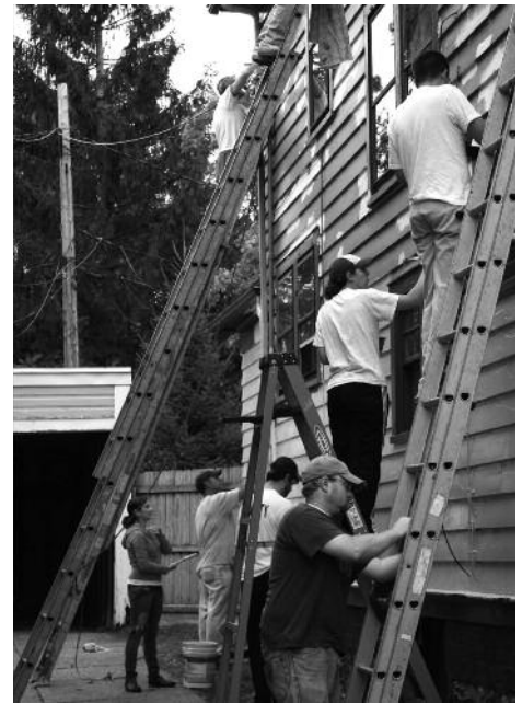
A Crew of dedicated Parksiders make short work of the Zornick Estates

The next time you drive down Parkside Avenue, look for the yellow house with green trim. There you will see a tribute marking the spot where people cared... about George, and about the neighborhood.